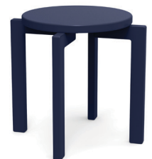
navy blue: ST-L4S-NB