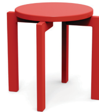
apple red: ST-L4S-AR