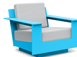
sky: NC-L-(cushion code)-SB