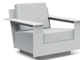
driftwood: NC-L-(cushion code)-DW