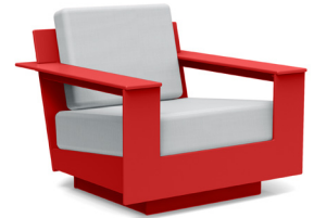
apple red: NC-L-(cushion code)-AR