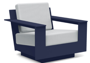
navy blue: NC-L-(cushion code)-NB