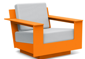
sunset: NC-L-(cushion code)-OR