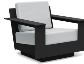
black: NC-L-(cushion code)-BL