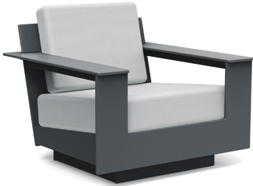
charcoal: NC-L-(cushion code)-CG