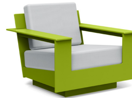
leaf: NC-L-(cushion code)-LG