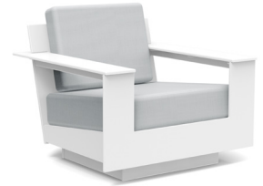
cloud: NC-L-(cushion code)-CW