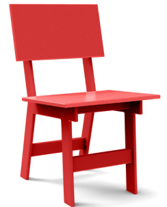
apple red: SC-EM-AR