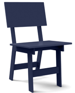
navy blue: SC-EM-NB