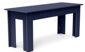
navy blue: LC-LB-NB