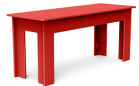
apple red: LC-LB-AR